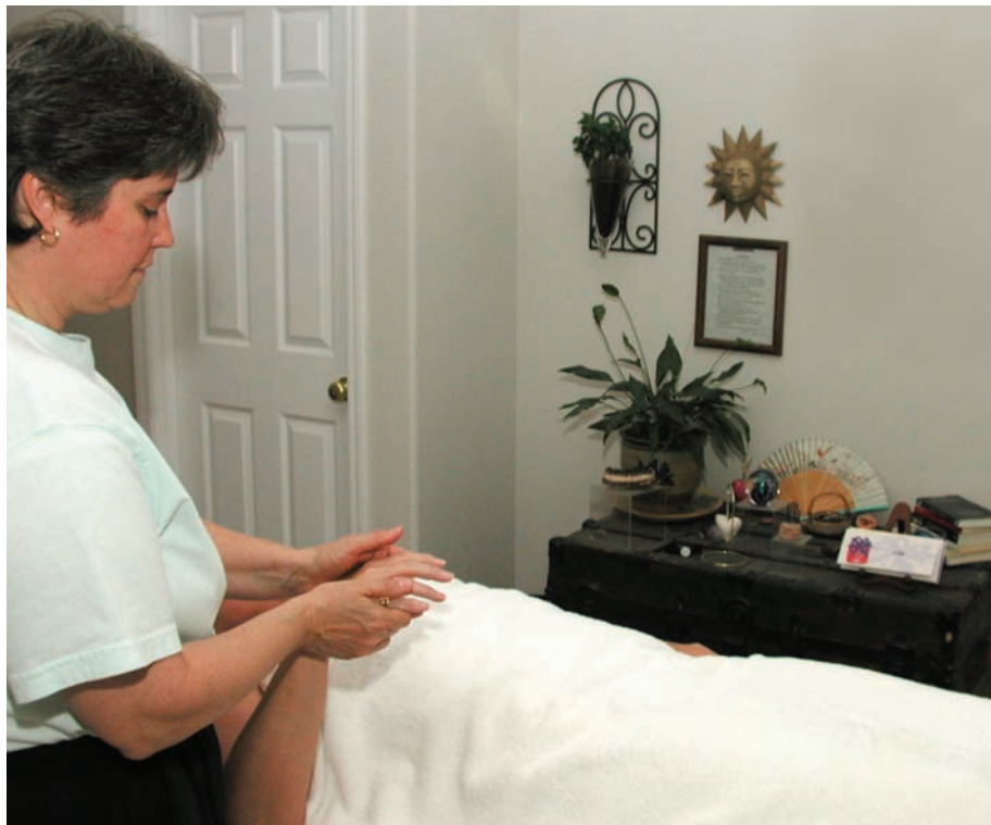
Quality client/therapist communication is crucial when doing oncology massage.

he got her an extra pillow to lie on. “I thought that would be enough and that if I just endured the pain of lying on my stomach, the massage would relax me and it would get better. The pain of lying on my stomach was just too much. Normally when a massage gets near the end, I think, ‘Oh no, don’t let it be over yet.’ This time I couldn’t get off that table fast enough,” she says. “In defense of the therapist, I probably should have been a little more forceful when the pain started. I’m pretty sure he was new and had no experience in the area of ‘massage after surgery.’ While I’ve always enjoyed deep-tissue massage, that probably won’t be the best for me for awhile, if ever.”