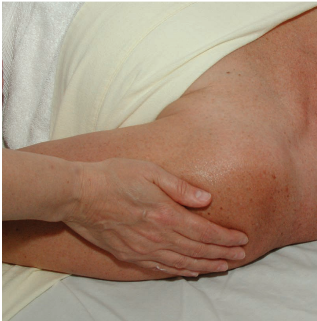
With 12 million cancer survivors in the United States, all massage therapists will need to know how to meet the needs of clients affected by cancer treatment.

“And, I was upset with myself for not speaking up,” Judy laments. It was 18 months before she had enough confidence to receive another massage,